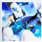
Nurturing the Whole Child at St. Stephen of Hungary (this site)