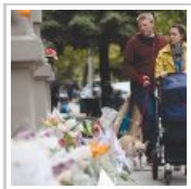
Nanny Nightmare (this site)