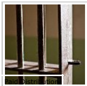
Wearing the wrong color socks is getting kids locked up in Mississippi (MamasLatinas)